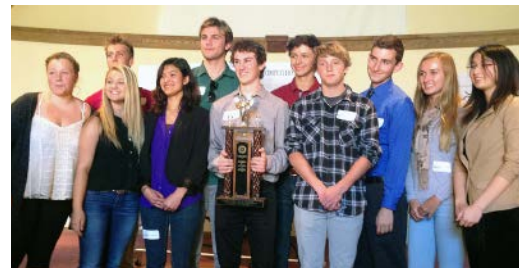
Participants in the 2014 High School Design Competition