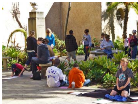
Kids Draw Architecture sketch session participants enjoy the beauty of Our Lady of Mount Carmel church.