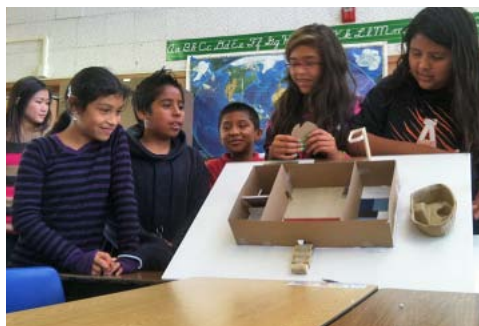
Adams Elementary School students participate in Built Environment Education Program.