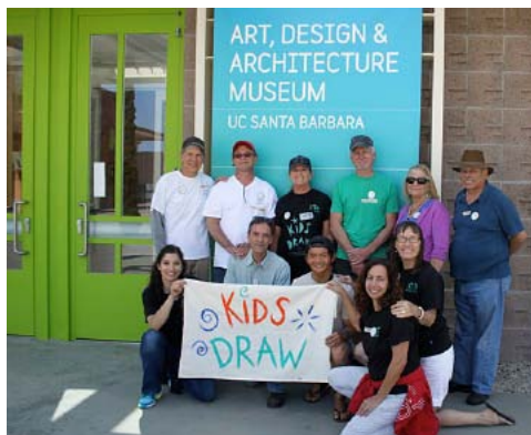
KDA sketch session volunteers at UCSB's Art, Design, and Architecture Museum.