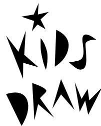
Architectural Foundation of Santa Barbara